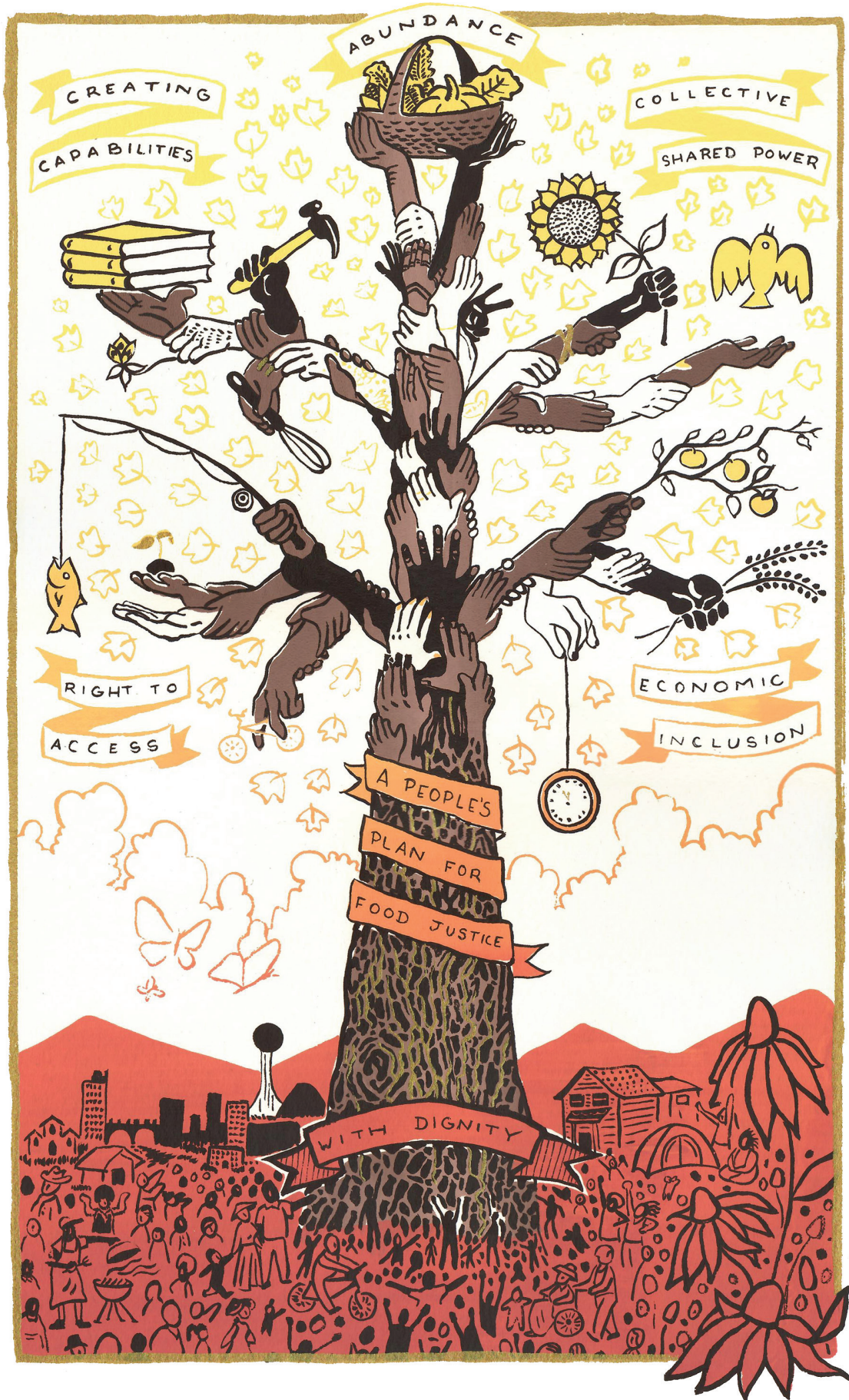
This artwork was created by Ashlee Mays of the Museum of Infinite Outcomes. The vision for the design was developed alongside food systems stakeholders at our planning retreat. The piece represents the power of our collective imagination.